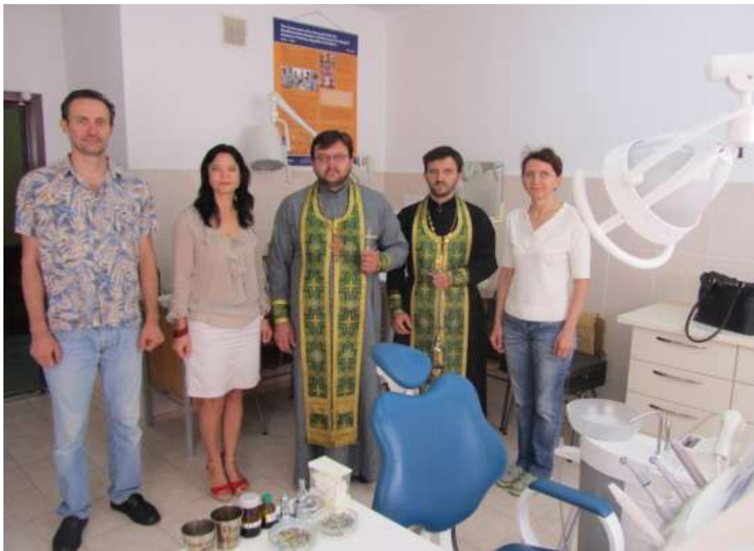
Foto 2. The inauguration by the Priest in August 2014